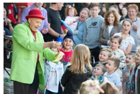
Our SMCT employees celebrated a wonderful year with their families at our Bunurong Memorial Park