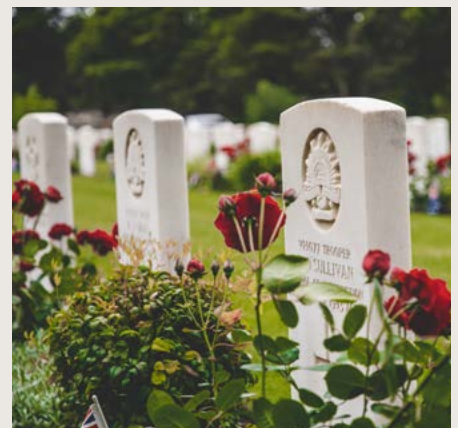
The Australian War Graves Garden of Remembrance at our Springvale location was filled with poppies