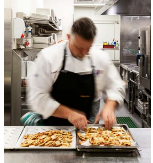
Our Café Vita et flores team members have been recognised for their service to the community

It's our greatest privilege to serve the community in such a tangible way, and we will continue to ensure everyone who walks through our doors feels welcomed and valued. Congratulations to our incredible team on such a wonderful achievement.