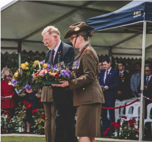
Laying of wreaths in honour and respect of our servicemen and women at the RSL Remembrance Service