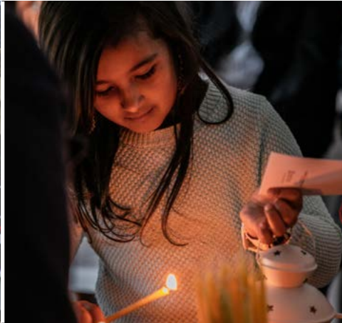
Families light the remembrance candle at our annual Children's Christmas Remembrance Service