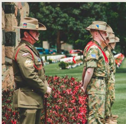
Australian war veterans and soliders at the RSL Remembrance event